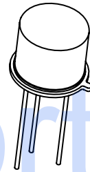
TO-5* 2N3498L, 2N3499L 2N2500L, 2N3501L