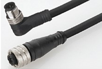
Series image - Reference only

Status: Active Series: 120066 Category: Molex Parts Engineering/Old PN: 884030KF3M100N