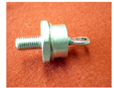
1N4510 Standard Rectifier (trr More Than 500ns)