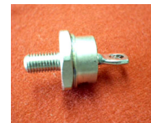
1N4510 Standard Rectifier (trr More Than 500ns)