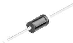
DO-35 Glass case COLOR BAND DENOTES CATHODE