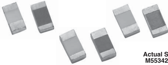
Actual Size M55342/02

Thin Film Mil chip resistors feature all sputtered wraparound termination for excellent adhesion and dimensional uniformity. They are ideal in applications requiring stringent performance requirements. Established reliability is assured through 100 % screening and extensive environmental lot testing. Wafer is sawed producing exact dimensions and clean, straight edges.