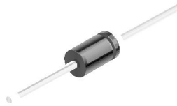
DO-41 Glass case COLOR BAND DENOTES CATHODE